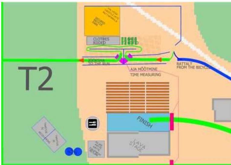
Transition area T2